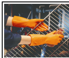
LATTICE GOMMA G02T