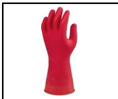
CAUCCIU' /NITRILE G44R