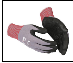
NYLON/LATTICE FOAM PUNTINATO